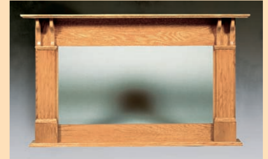
SUGGESTED MIRROR DESIGN FOR HOGARTH MANTEL